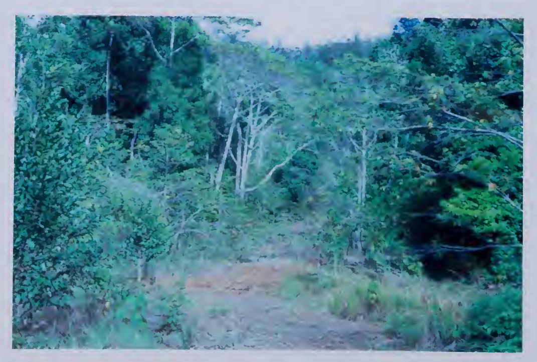
Figure 5 Disturbed volcanic forest along track to Turtle Beach.

Gag Island has a tropical monsoon type climate, characterised by year-round moderate temperatures and high relative humidity. Its climate is influenced by the south-east trade winds from May to October and the north-west monsoons from December to April. The wet season (north-west monsoon) begins in October, peaks in December-January and may continue until April. Mean daily temperatures vary between about 21° and 34° C.